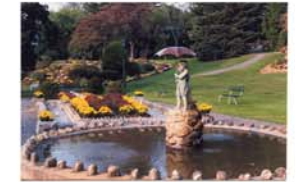
Fountain at Seamon Park