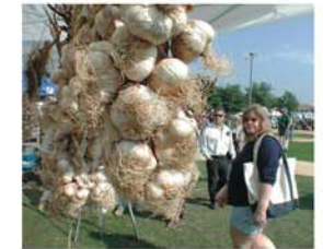
Hudson Valley Garlic Festival™